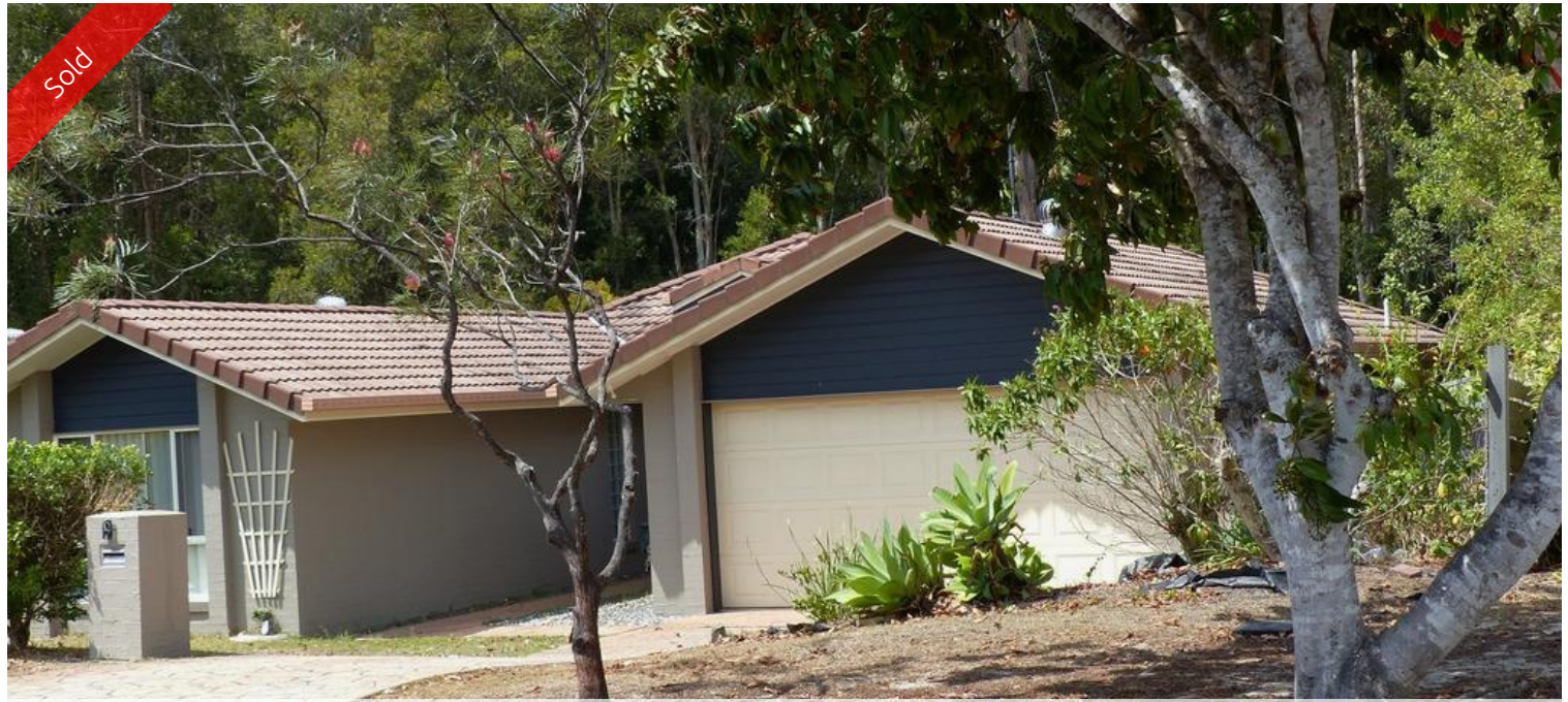
9 Park View Court, Tewantin